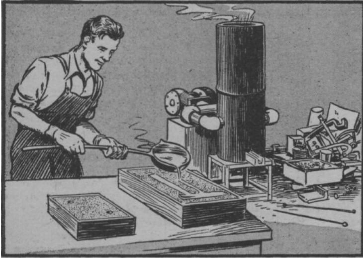
One man can easily handle this cupola. It will melt 35 lbs. of iron at a time, or about 300 lbs. per hour.

I RON can be melted in small quantities, and very inexpensively with the small cupola described in this article. The simple materials for its construction are obtainable almost anywhere. One man can easily take care of the furnace, charging the coke and metal, tapping and pouring. Under ordinary conditions it will melt about 330 pounds of metal per hour. This can be increased to 400 pounds per hour, but such rapid melting is hard on the lining and is not recommended.